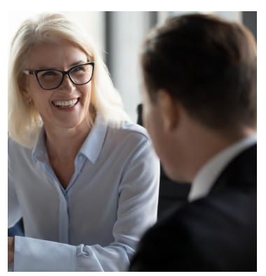
Boosting face-to-face conversations (hearing enhancement)