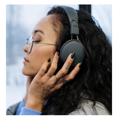
Dynamic enhancement of music perception