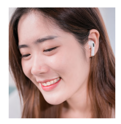
Automatic volume and EQ adjustment of audio

The following partner companies will feature select Alango demonstrations: