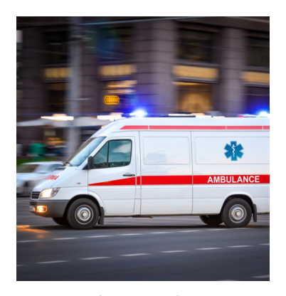
Automotive ambient sound acquisition without microphones